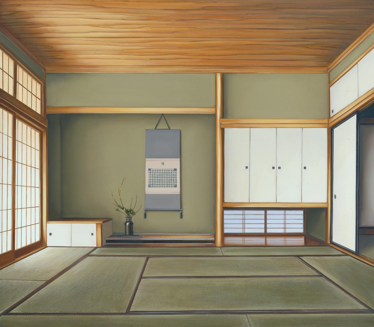
Lisa Milroy Hyper-realistic painting