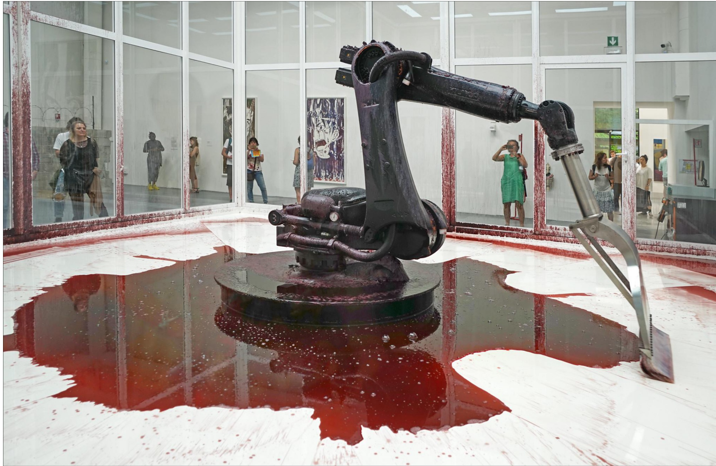
Sun Yuan and Peng Yu

https://www.youtube.com/watch?v=ZS4Bpr2BgnE&ab_channel=VernissageTV