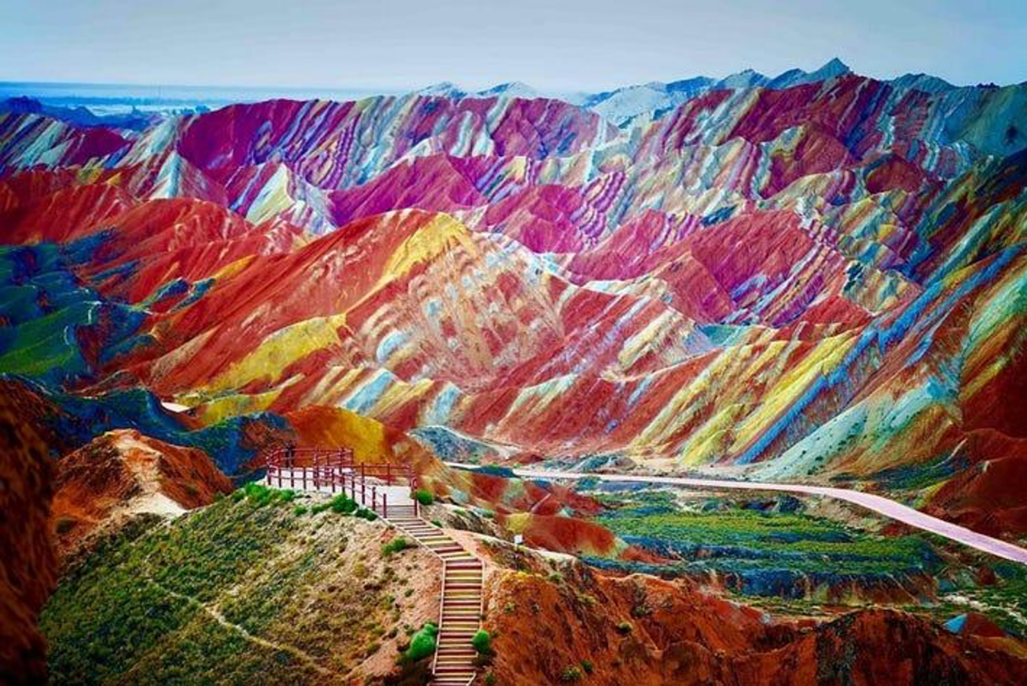
Rainbow mountains, China